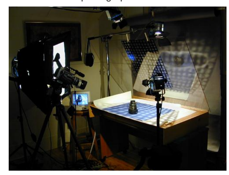
ClassicPosters.com Photo Studio

artists, vendors, and collectors are interviewed and photographed.