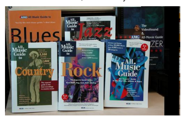
All-Music Guide - some of the series

communications networks, including Compuserve, AOL, Apple's E-World, the Microsoft Network, and many others.